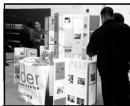
Reading the student essays

El pasado 20 de octubre en la secundaria Cristo Rey, Poder Learning Center participó como en años anteriores en el evento de Nuestro Retrato con otras organizaciones comunitarias; las cuales forman el Consejo Hispano de Alfabetización. Durante el evento hubo exposiciones mostrando el trabajo de los estudiantes de las diferentes organizaciones. Estuvieron presentes más de 300 personas entre ellos estudiantes, directores, maestros y voluntarios. Los estudiantes de Poder hicieron un excelente trabajo para la exposición. Ya como tradición después la misma exposición fue traída a la escuela. También hubo un programa en donde los estudiantes participaron con canciones, poemas y lecturas. De igual manera durante el programa el grupo del primer nivel de las 6:30 presentó una canción en inglés e hicieron un excelente trabajo. Muchas gracias a todos los estudiantes y a los maestros por su participación en este evento.