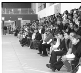
Poder students listen to others present their work

El pasado 20 de octubre en la secundaria Cristo Rey, Poder Learning Center participó como en años anteriores en el evento de Nuestro Retrato con otras organizaciones comunitarias; las cuales forman el Consejo Hispano de Alfabetización. Durante el evento hubo exposiciones mostrando el trabajo de los estudiantes de las diferentes organizaciones. Estuvieron presentes más de 300 personas entre ellos estudiantes, directores, maestros y voluntarios. Los estudiantes de Poder hicieron un excelente trabajo para la exposición. Ya como tradición después la misma exposición fue traída a la escuela. También hubo un programa en donde los estudiantes participaron con canciones, poemas y lecturas. De igual manera durante el programa el grupo del primer nivel de las 6:30 presentó una canción en inglés e hicieron un excelente trabajo. Muchas gracias a todos los estudiantes y a los maestros por su participación en este evento.