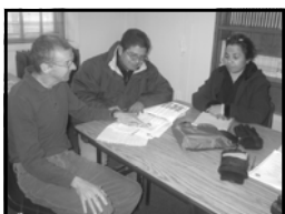
Students ask for help